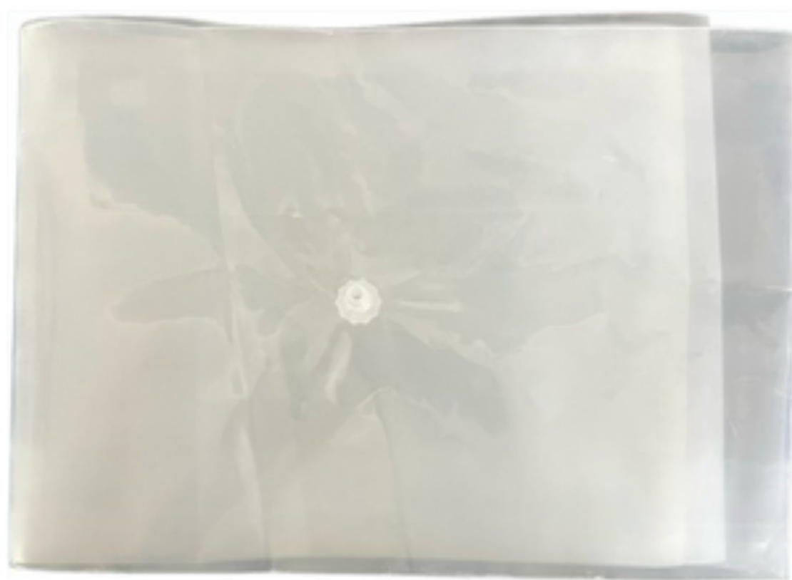
ozone wound bags