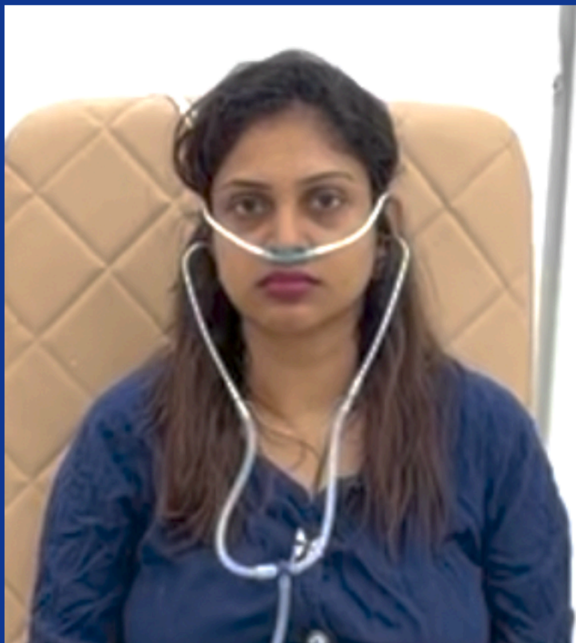
Aural Ozone stethoscope