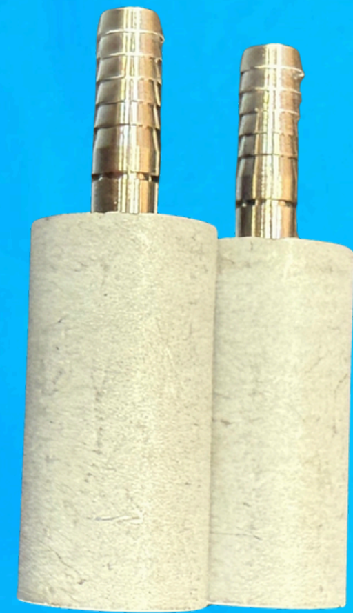
Stainless Steel Diffuser