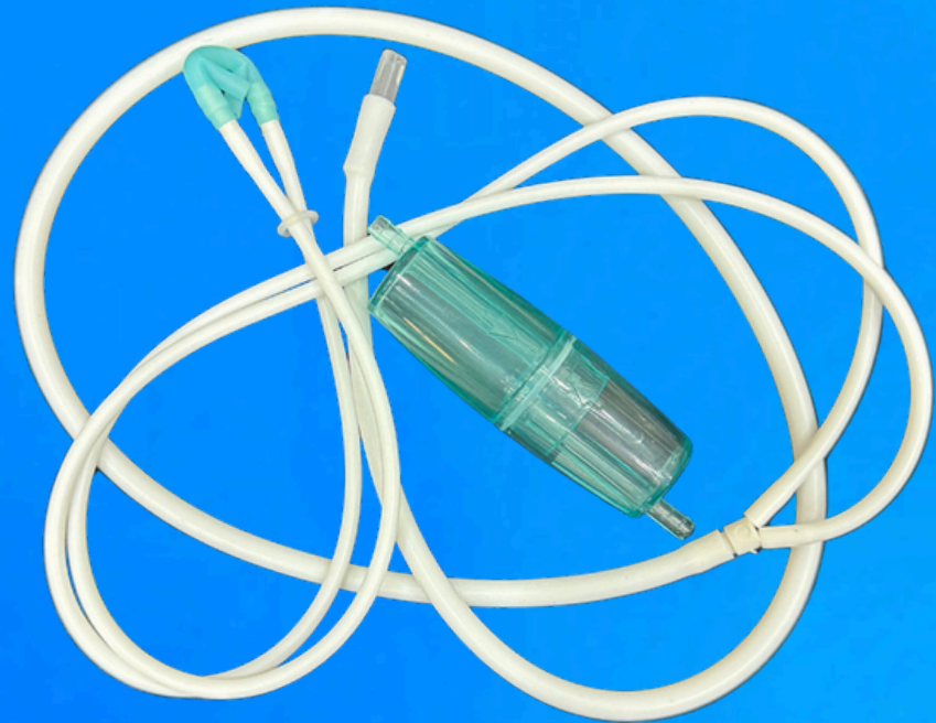
Hydrogen and Oxygen Inhalation Tube