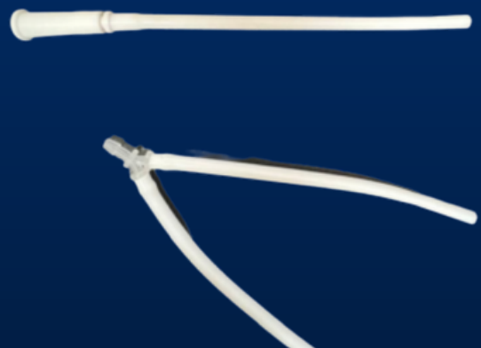
Two way Tube and IV connector