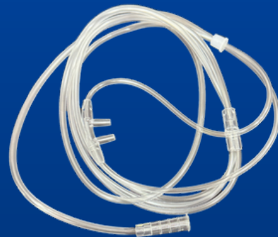
Hydrogen and Oxygen Inhalation Tube