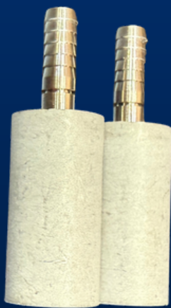
Stainless Steel Diffuser